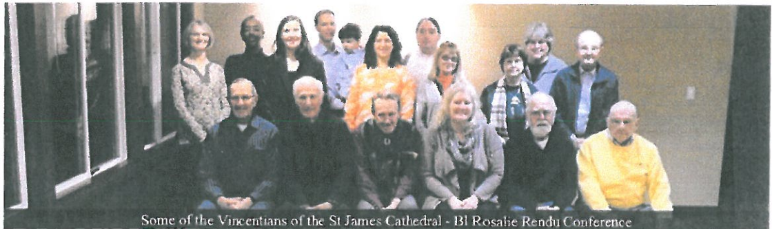
Some of the Vincentians of the St James Cathedral - BI Rosalie Rendu Conference